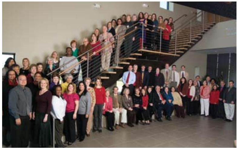
SEDL staff at the 2008 Holiday Luncheon