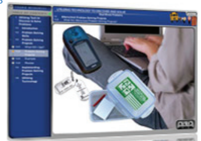
Utilizing Technology to Discover and Solve Real-World Problems