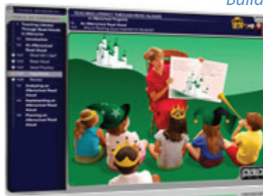
Teaching Literacy Through Read Alouds in Afterschool Programs