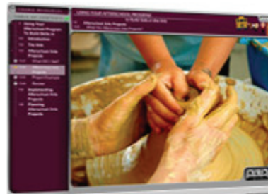
Using Your Afterschool Program to Build Skills in the Arts