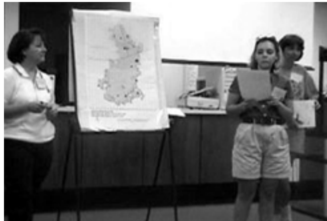
Teachers at Carencro Middle School in Carencro, LA also participated in the Managing Growth activity. Here, they present their community growth scenario to colleagues.

Students broke into teams and began discussing what kind of future community they envisioned and desired, and how growth could help or hinder the attainment of this vision. Within their various teams, they divided again into two groups. The first, a population projection group, used historical US Census data and spreadsheet software to project the community’s population for the year 2010. Using the various functions of a spreadsheet, students generated their population projection data in the form of trend lines (showing whether growth was linear or exponential), a table and line chart.